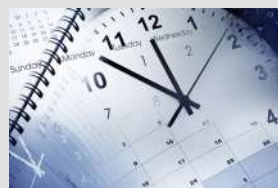
Time & Attendance